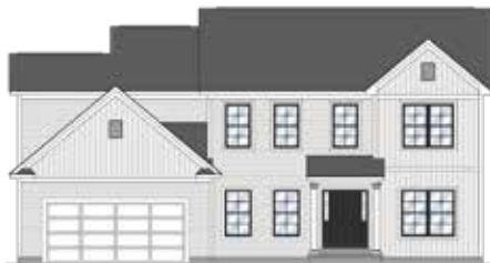
AMERICAN FARMHOUSE Shown with 2-Story Family Room