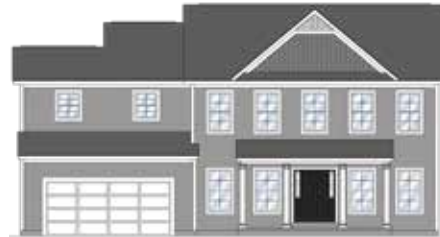
COUNTRY MANOR Shown with 2-Story Family Room