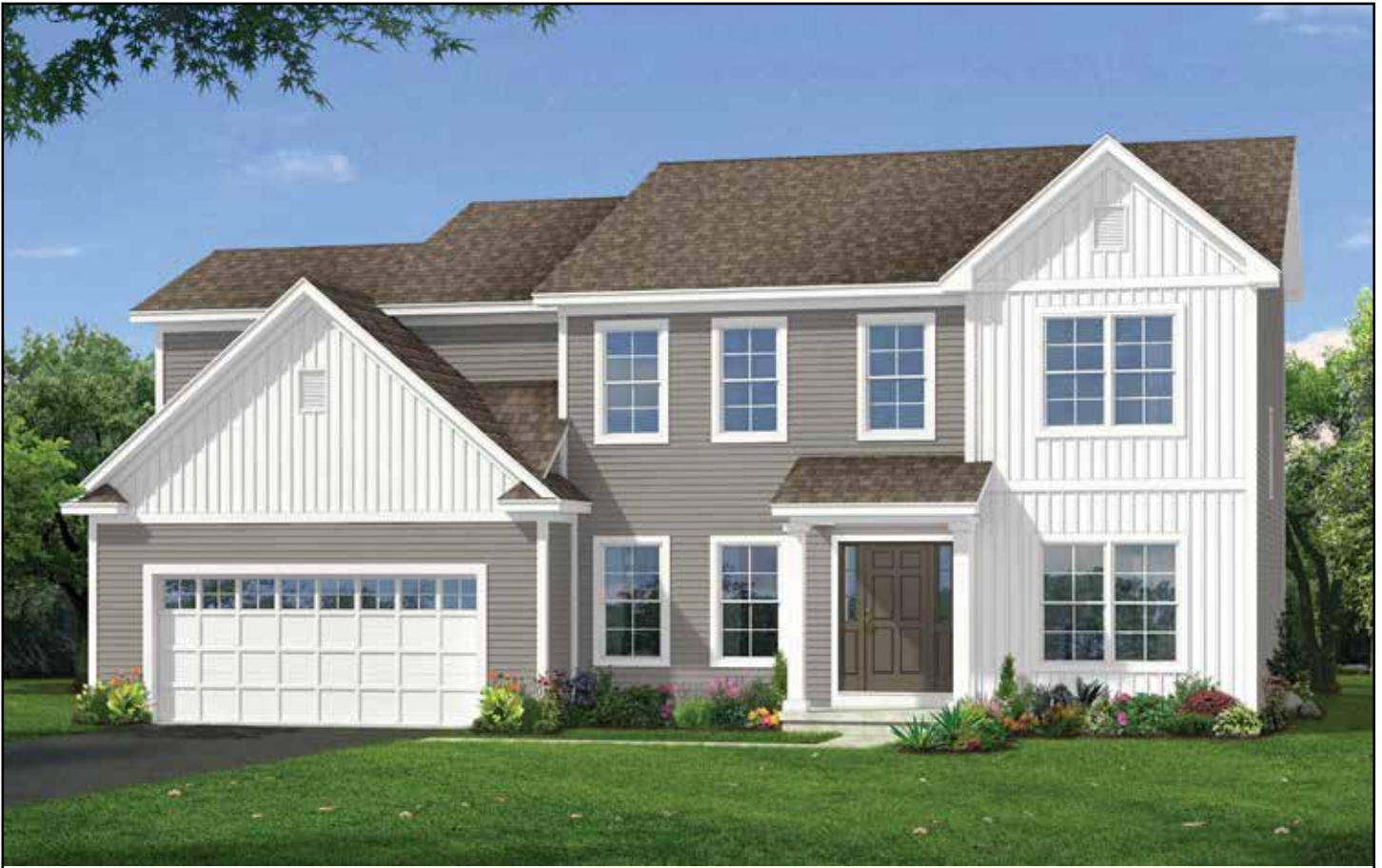
AMERICAN FARMHOUSE elevation shown with 2-story family room.